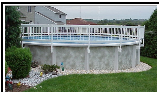
MAKE YOUR POOL SAFE & ATTRACTIVE