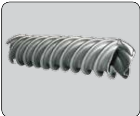
Titanium heat exchanger is highly durable and provides excellent resistance to corrosion.