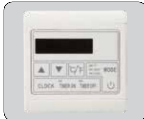
Complete with a digital keyboard allowing all operation parameters to be set and displayed on the control panel.